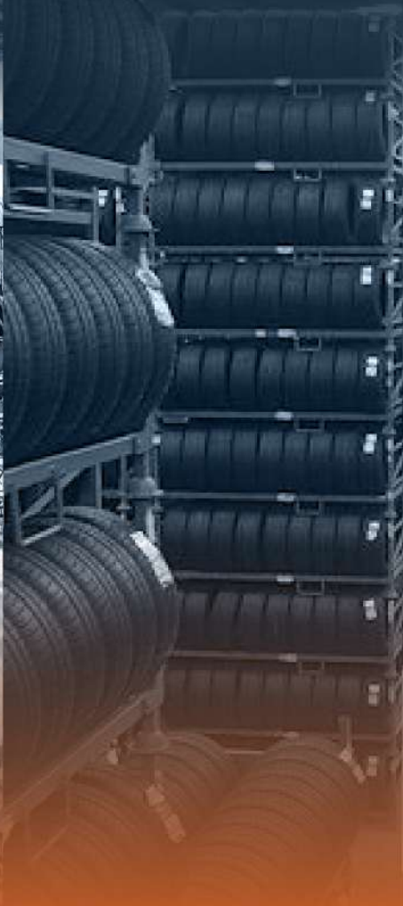
AIRCRAFT TYRE STORAGE