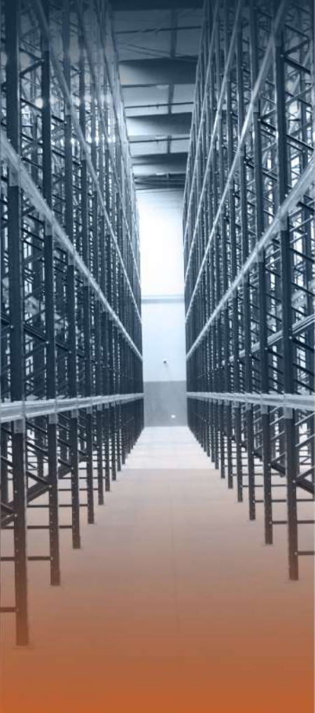
BONDED & NON BONDED STORAGE SOLUTIONS