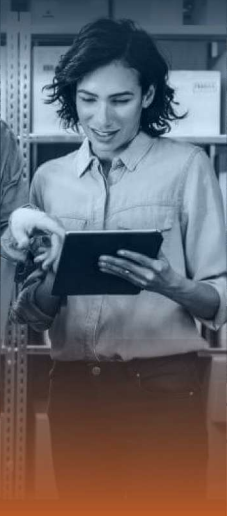
HOSPITALITY INVENTORY MANAGEMENT