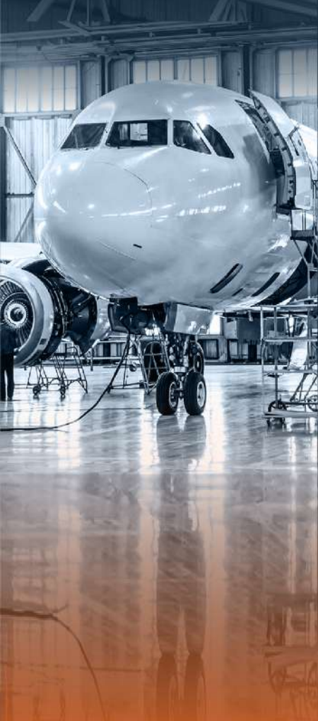
AOG SPAREPART MANAGEMENT